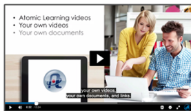
Atomic Learning Video with cielo24 Captions

"The other thing is that having the closed captioning on is a great way to reinforce language development for ESL students. Not the direct reason we do it, but it is a secondary reason."